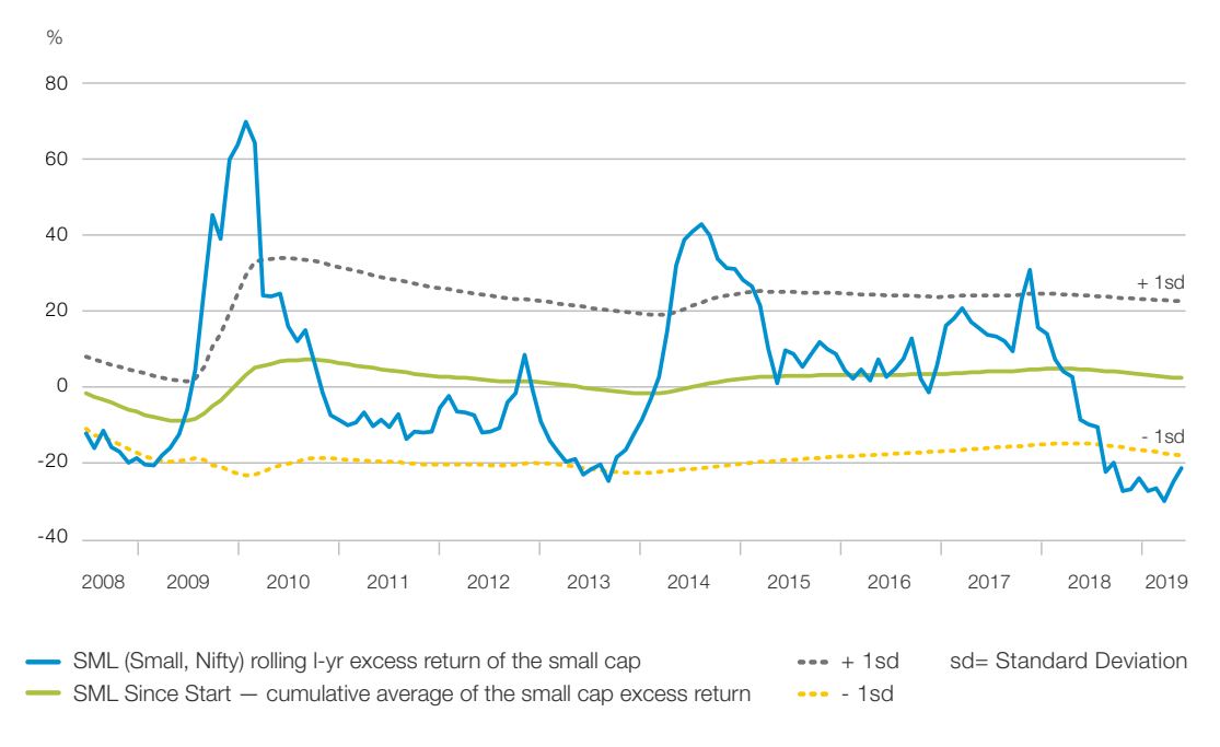
Fig. 28 Small-cap positive cycle is imminent